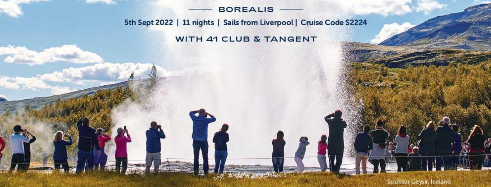
Strokkur Geysir, Iceland

You're in for an unforgettable adventure, as you go in search of the wonders and wildlife of Iceland and the Faroe Islands. From Reykjavik, journey to witness the natural power of the Gullfoss Waterfall and gushing Geysir hot springs. From Akureyri go whale watching in the northern waters to look out for humpback and minke whales, dolphins and porpoises.